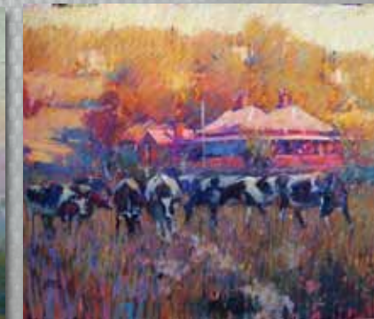
Pastels November 18/19