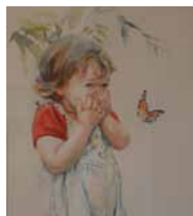
Left / 'Ah!' Olga Parr