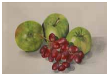
Above / 'Cider and Wine' Yvonne Correlje