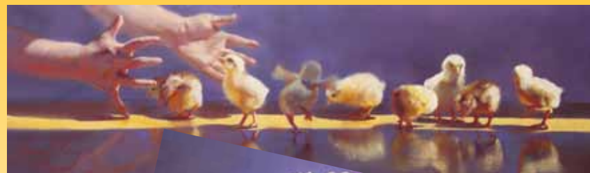
Chicks

Watercolour, oils, pastels and acrylics, sculpture, textiles and print-making – all this and more will be encompassed in the simultaneous demonstrations by a diverse range of artists.