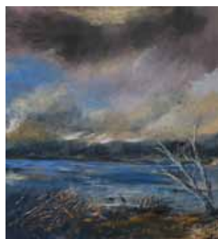
Above / 'Tasmanian Sunset' Aileen Gough