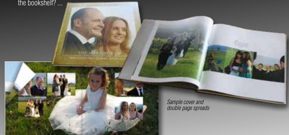
Sample cover and double page spreads