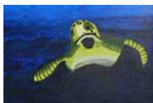
Opposite / 'Turtle' Ruby Hirst