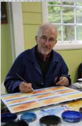
A Mountford Experience July 29/30