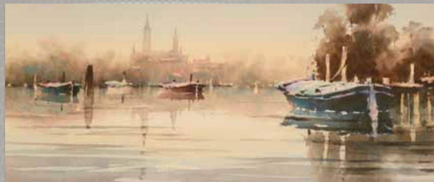
Beginners Watercolours September 29 / October 1